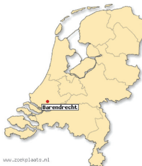
Figure 2 Location of Barendrecht in the Netherlands (Zoekplaats, 2010)

Barendrecht is located in the west of the Netherlands (see figure 1), and has a population of approximately 44,000 people (Gemeente Barendrecht, 2009). The town is situated between the Rivers Maas (south of the town) and Rhine (north of the town). It is part of the conurbation of Rotterdam and close to the heavily industrialised Rijnmond district. The Rijnmond industrial area is home to a number of large oil refineries operated by (among others) Shell, ExxonMobil, Kuwait Petroleum (Q8) and BP, as well as chemical manufacturing plants such as Dow Chemical and ICI/ Akzo Nobel. This area is responsible for the bulk of chemical and fuel manufacture, storage and transport for large parts of central Europe. The area contributes significantly to the Dutch economy, but is also given precedence in Dutch energy and climate policy given its high rate of energy consumption and contribution to the country's greenhouse gas emissions.