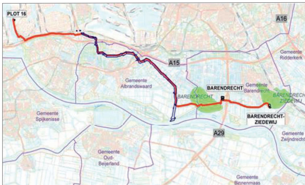
Figure 1 The location of the planned CO 2 pipeline and gasfields in Barendrecht

If successful, the Shell project at Barendrecht could lay the foundation for the replication of fully integrated CCS systems both in Rotterdam and the rest of the Netherlands. The Dutch Government is also optimistic that the project contributes to the development and innovation of CCS technologies in the country, placing the Netherlands in a favourable position for the international trade of equipment and expertise. If the endeavour is abandoned for whatever reason, this will negatively affect the attainability of local and national emission targets (Herber, 2008), and will perhaps warrant a government re-think of the deployment strategy for further CCS projects.